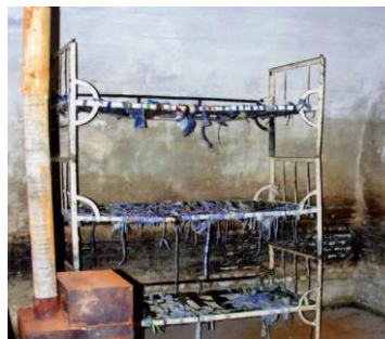
Prison cell with bunkbeds with no mattress, prisoners were obliged to sleep on. Stove for show only, never heated in cold winters.