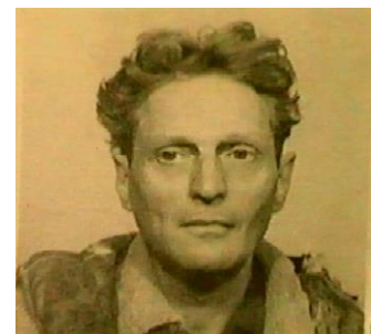
Mug-shot of Late Reverend Richard Wurmbrand when held in the Jilava prison, in communist Romania.